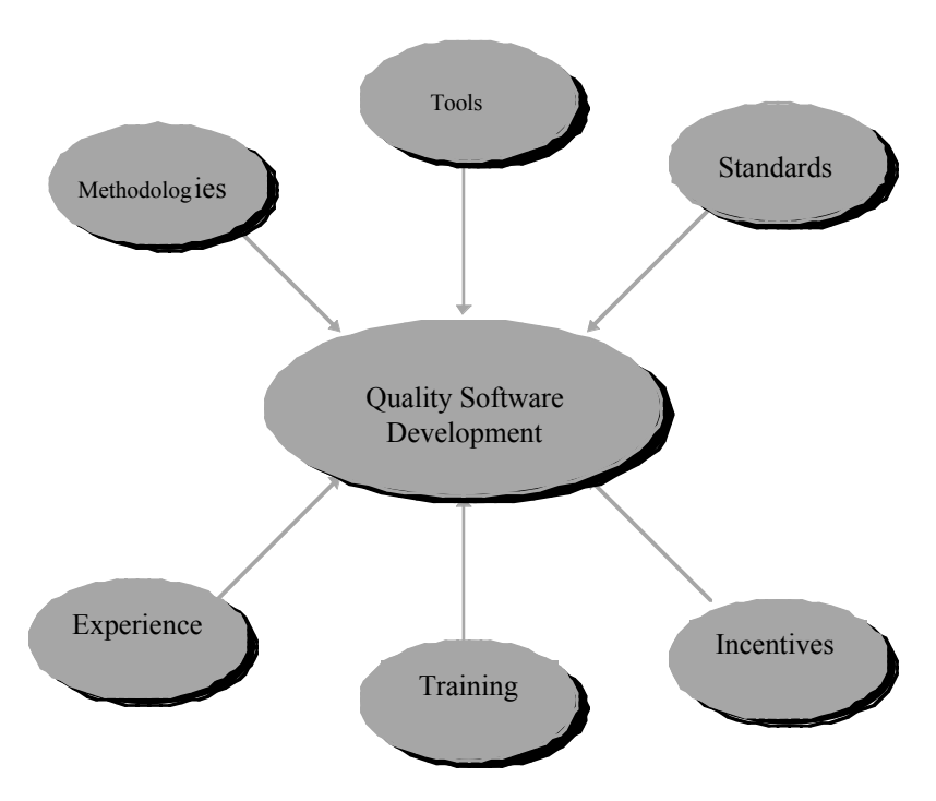
Figure 1 A Sample of Quality-Drivers