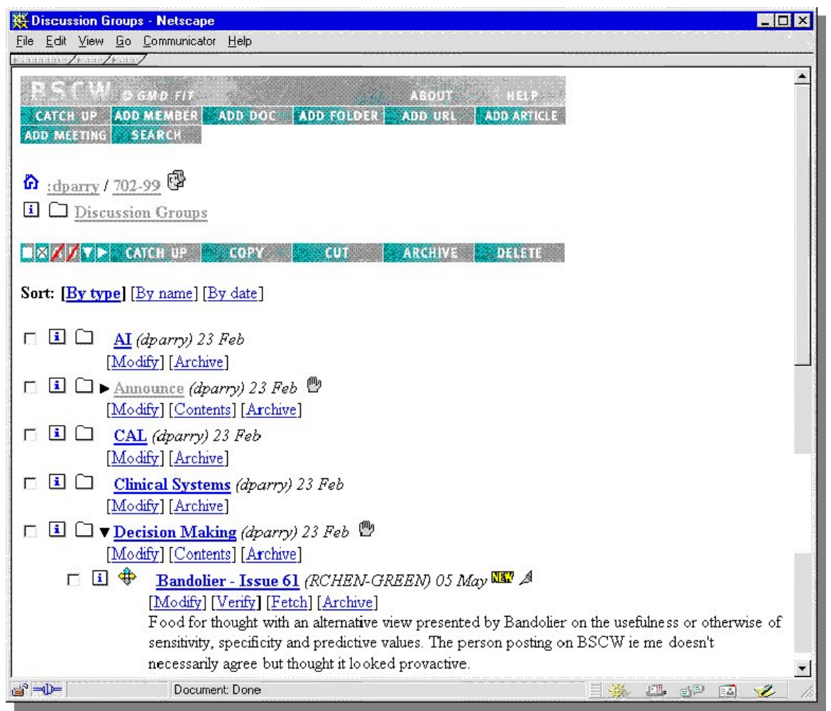
Figure 4: A BSCW discussion group