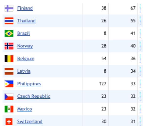
Figure 2. A snapshot of the by-country statistics display, showing number of abstract views and downloads, respectively.

We look forward to exploring these reasons further through an online questionnaire addressed to repository users during the first quarter of 2006, and would welcome any suggestions or ideas that colleagues may have about how to pursue this work. In the interim, we are also keen to evaluate the impact of the IR within our own institution. We have anecdotal evidence, for example, that the IR has motivated colleagues to complete papers for inclusion in the repository. It has also allowed us to capture historical material that is rare or difficult to obtain. The public nature of the IR has also stimulated colleagues to take interest in the countries that have viewed their papers (see Figure 2); daily checks of download statistics are commonly reported. The statistics and particularly the ability to check for citations are being used as one of the measures for peer esteem as required by New Zealand’s PBRF regime. Given the growing number of requests for demonstrations, the IR appears to be functioning as a catalyst for wider adoption and has created a very valuable feedback loop.