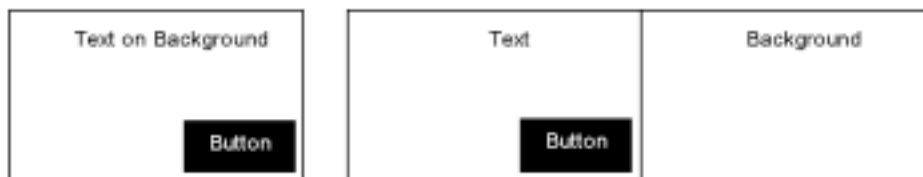
Fig. 1. System design for the standard single layered display (left) and the MLD TM (right)

Four experimental systems were developed, using VisualBasic 6.0 (one for each colour group for each of the two displays). Systems designed for the single layered display were implemented with the text overlaid on the background, and for the screen dimensions of 1024 x 768 pixels. Systems designed for the MLD TM were twice the width (2048 x 768 pixels), to reflect the way the MLD TM treats the display as a ‘double-width’ standard display, that ‘wraps’ the content around. Therefore text and buttons were put on the left hand side, and the background on the right hand side. Participants navigated through the system by clicking on buttons, which also acted as a trigger to start and stop the timers (for each reading and set of comprehension questions).